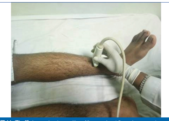
[Table/Fig-3]: Image showing position of linear probe at 3 cm above superior retinaculum for localising Deep Peroneal Nerve (DPN).

and DPN was localised 3 cm proximal to the superior extensor retinaculum ITable/Fig-3.41.